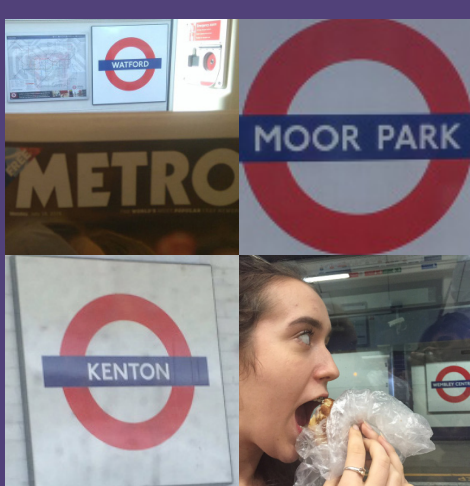
Year 12 students taking part in the Tube Challenge