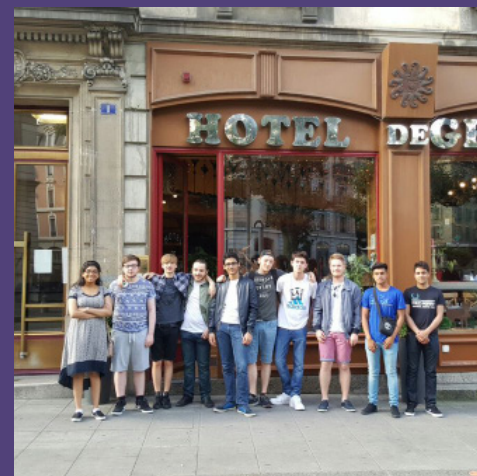
Year 12 Physics students visiting CERN in Switzerland