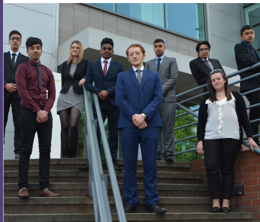
Year 12 Business students