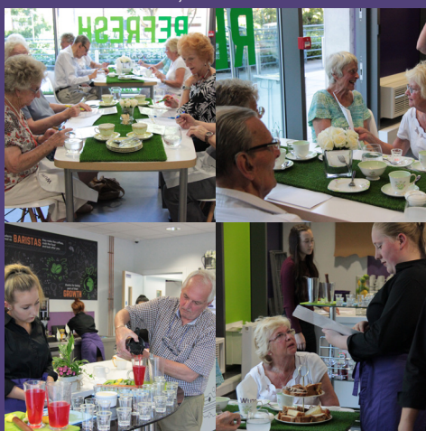
WUTC Gives Back, hosted by Year 10 Hospitality students in aid of Age UK