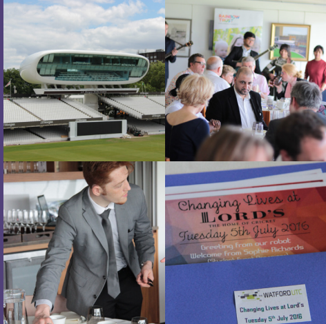
Lords Cricket Ground hosting 'Changing Lives at Lords', Lords Cricket Ground