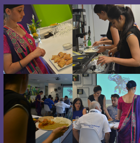
Pop Up Indian Restaurant 'Masala Spice', where local business people had lunch