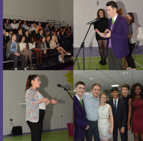
Year 11 'Celebration Assembly'