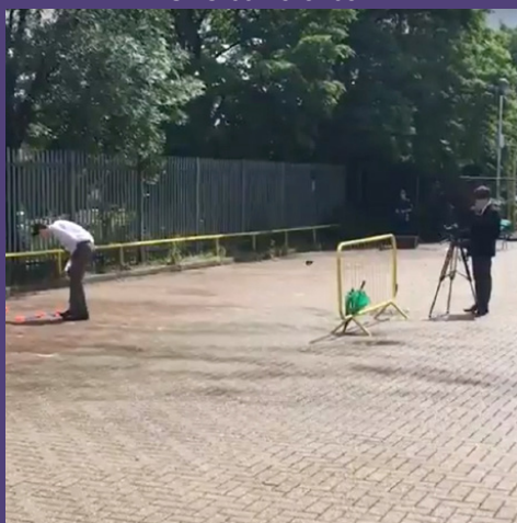
Year 10 students taking part in the Bloodhound Rocket Challenge