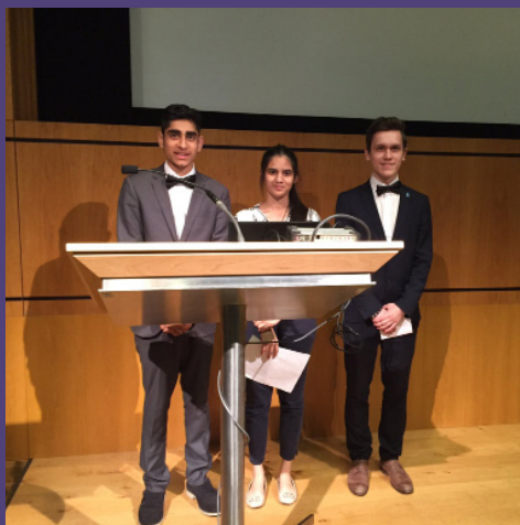
Students from WUTC closing the annual UTC conference