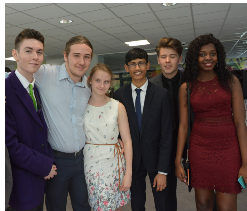
Year 11 'Celebration Assembly'