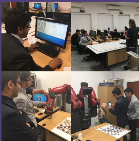
Year 12 IT and Computing students having a taster day at University of Hertfordshire