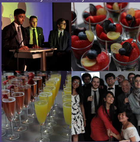
Year 13 Graduation Event, with bubbles and canapes