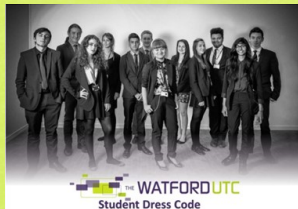
WATFORD UTC Student Dress Code

Please refresh your memory on our dress code.