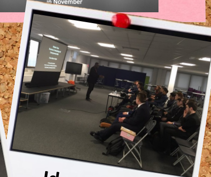
Ideas to Apps